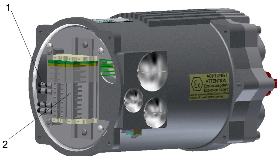
Figure 4: 1... shielding connection clamp, 2... terminal strip

The cable types recommended are standard patch cables (twisted pair, S/UTP, AWG26, Cat5e). The cable shield has to be connected to the actuator housing over the shielding connection clamp. It is important to ensure that there are no potential differences between the individual devices in the EtherNet/IP network so that no transient currents flow over the cable shield.